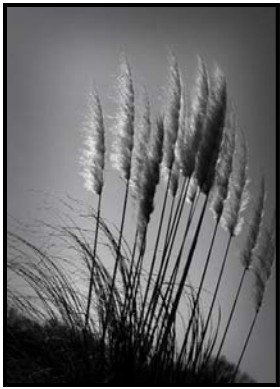
January Windy Day