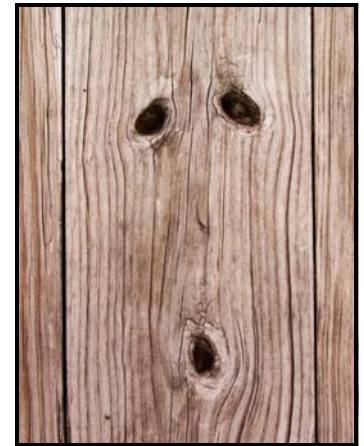
July Face on a Plank