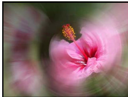
June Twirling Pink Hibiscus