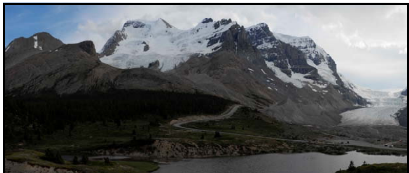
September Douglas Glacier