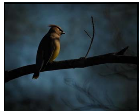
December Evening Solitude