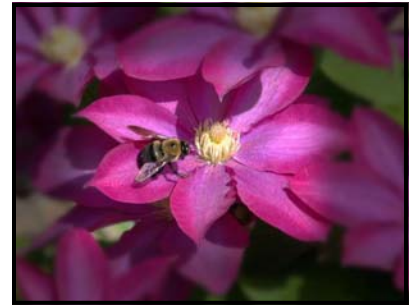
April Bee and Flower