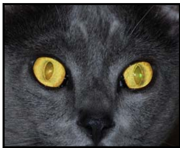
May Cat Eyes